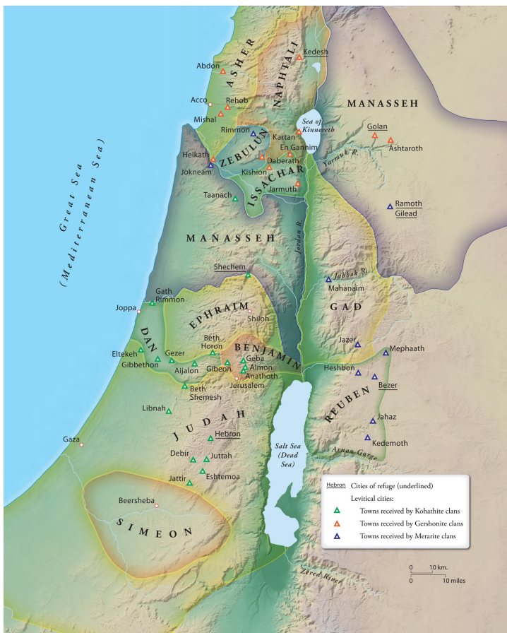
Map to help visualize cities of refuge - UNDERLINED CLICK TO ENLARGE

2 Samuel 2:23 However, he (ASAHEL) refused to turn aside; therefore Abner struck him in the belly with the butt end of the spear, so that the spear came out at his back. And he fell there and died on the spot. And it came about that all who came to the place where Asahel had fallen and died, stood still.